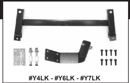
(Diagram A - Rear View)

Raise cart & support frame w/ jack stands. Remove rear body inspection cover. Remove shocks from top mounts. Remove sway bar from bottom mount. Confirm that all wiring & cables are free of binding. Install new "H" bracket to upper shock mounts. Install shocks to "H" bracket. Shock mounts on front of axle bracket mount. Spacer bushings go inside lower shock axle mount bracket. Install new sway bar bracket and 3/8" aluminum spacer plate (see Diagram B) between axle and chassis with longer bolts. Replace fuel line or bend fuel pump bracket on gas models. Inner fender wells may need to be trimmed or tied back for tire clearance on some tire sizes.